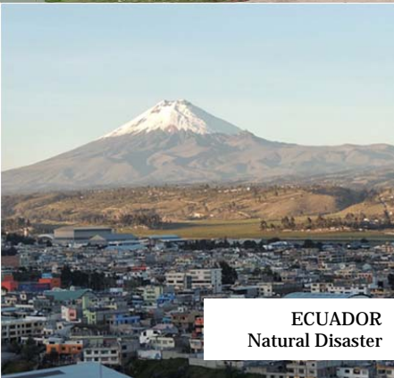
ECUADOR Natural Disaster