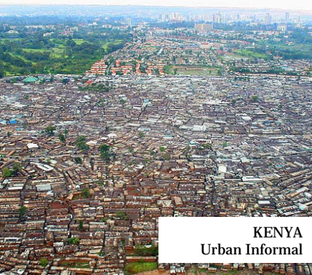
KENYA Urban Informal